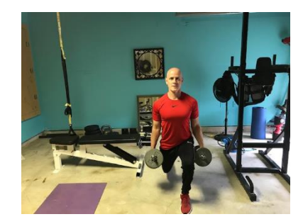
2 DB Lunge Bottom