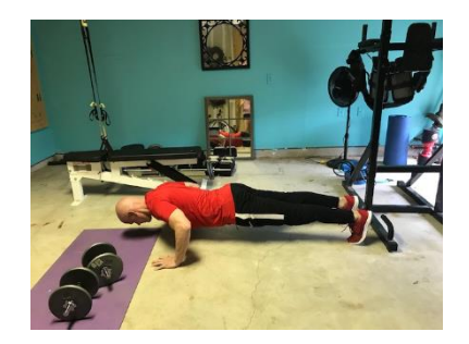
Floor Push-Up Bottom