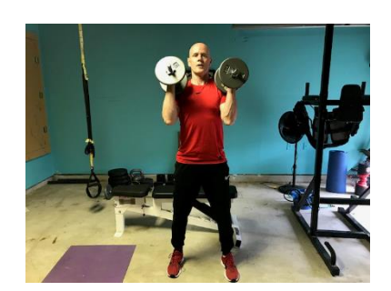
DB Press Bottom