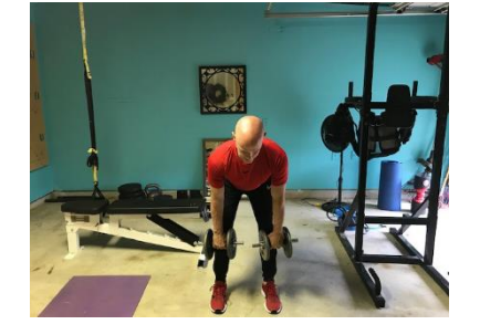
DB Deadlift Bottom