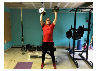
DB Press Top