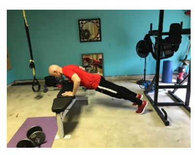
Bench Push-Up Bottom