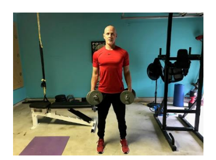
DB Deadlift Ready Position