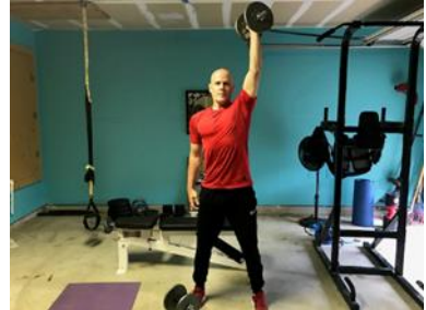
1 DB Press Top