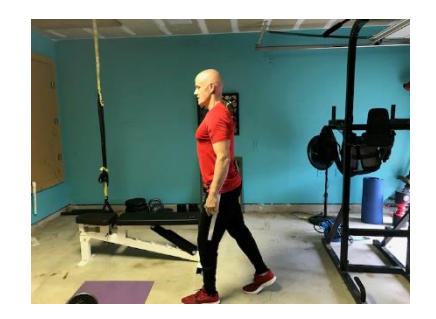
Singe Leg Hinge Ready